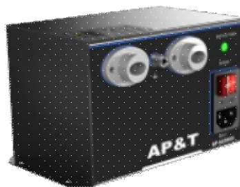
AP-AC2455 series power supply